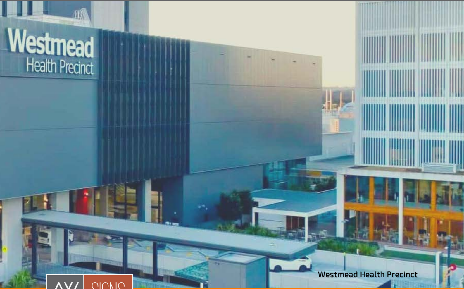
Westmead Health Precinct